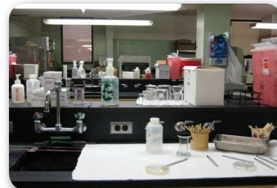
Current Student Workstations

a sink with running water and drawers for equipment storage.