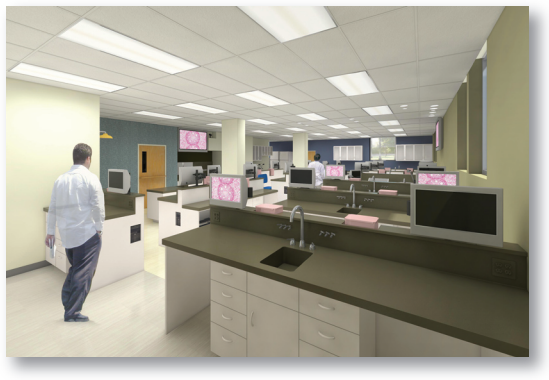
Artist renderings of Room A927

Have you heard of the phrase "out with the old and in with the new?" This is what is being said about the lab renovation in the Department of Clinical Laboratory Sciences. It's been 40 years since the lab has been upgraded, and now it's being demolished to make way for new state-of-the-art equipment that will bring the CLS department a much-needed new look for current and future students