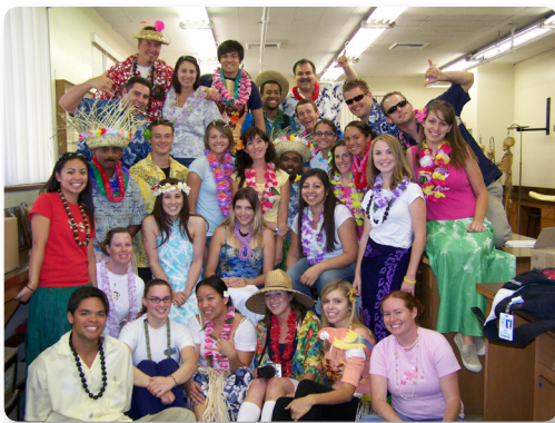
Second year TAs during the summer of 2007